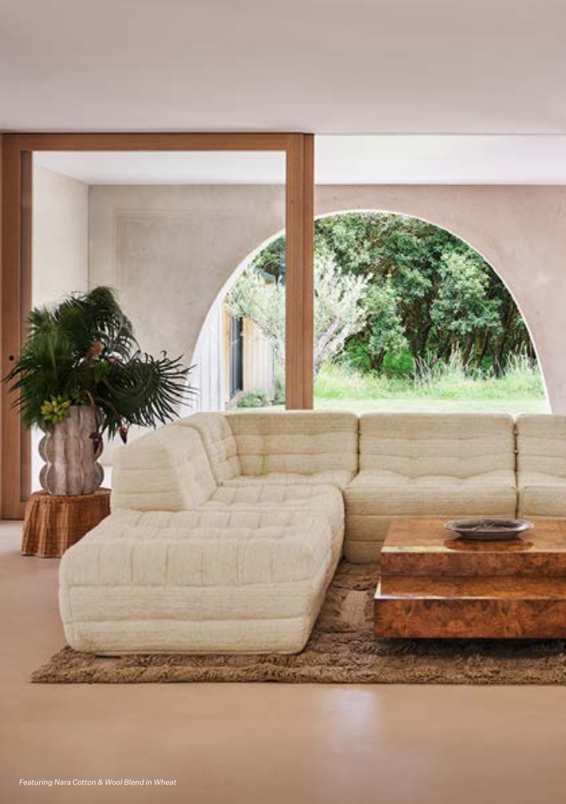
Featuring Nara Cotton & Wool Blend in Wheat