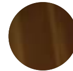
FIR GOLD (V-FG)