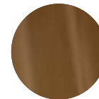
BURNT BUTTER (V-BB)