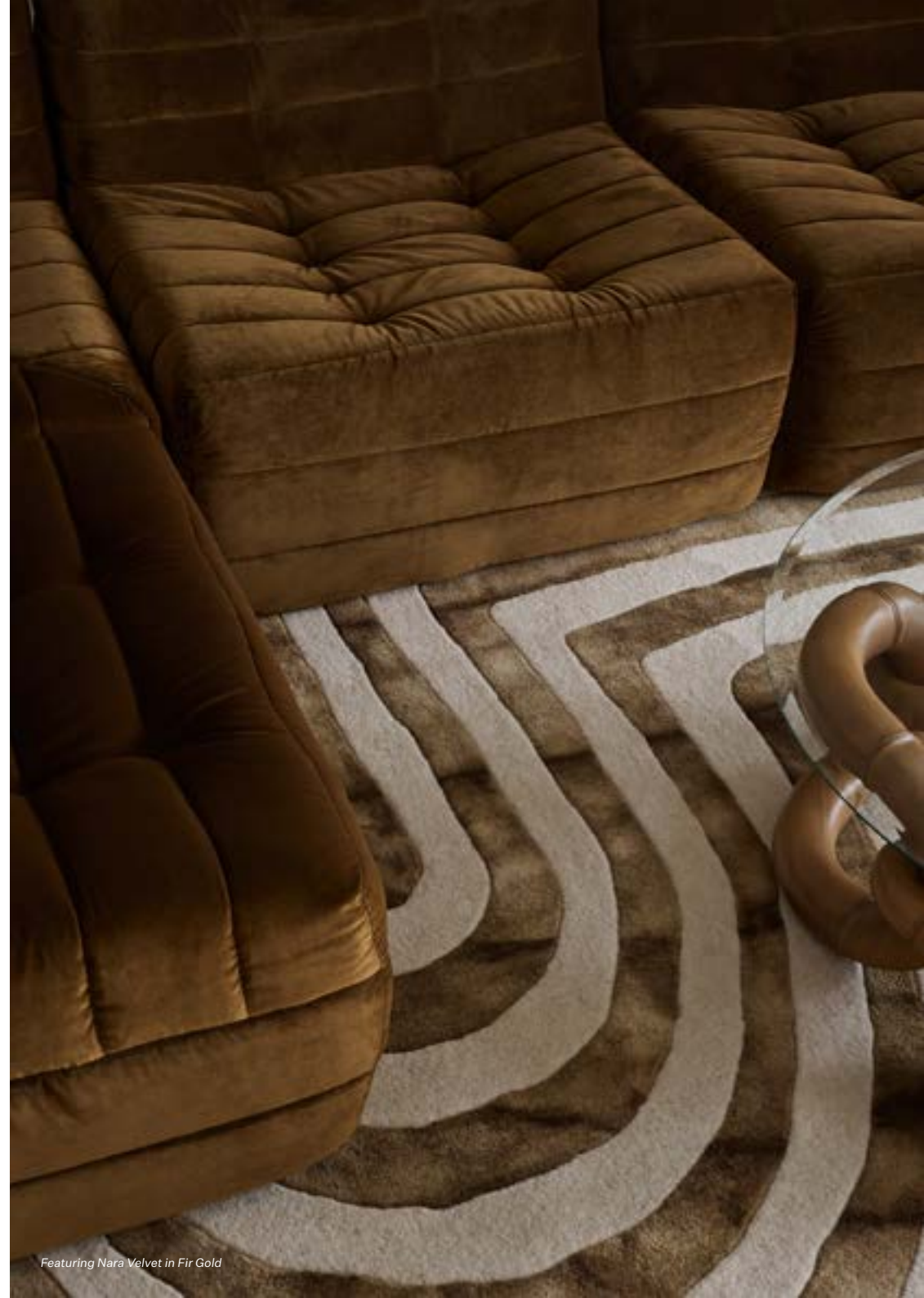
Featuring Nara Velvet in Fir Gold

With endless configurations, it is designed to be a bespoke and intuitive piece of furniture, fitting seamlessly into any space.